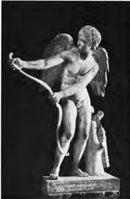
Fig. 34. Eros or Cupid.

There were once a king and queen who had three daughters. While the beauty of the two